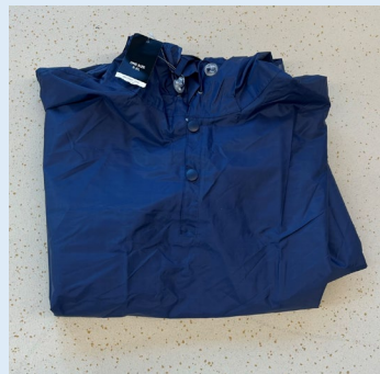
Clothing without packaging

Dispose of packaging & fold item in the table