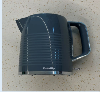
No barcode AND no item number