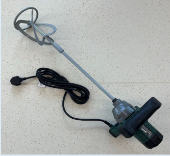
Electrical item outside of packaging