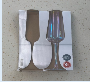
Item with missing parts

If you can't guarantee all parts & instructions are inside