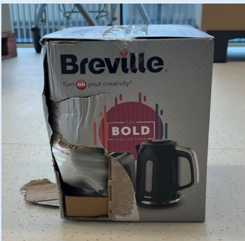
Lightly damaged packaging

If the item has a barcode OR item number